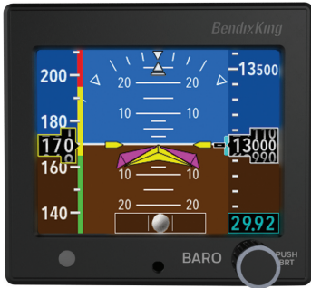
AeroFlight KI 300 Attitude Indicator