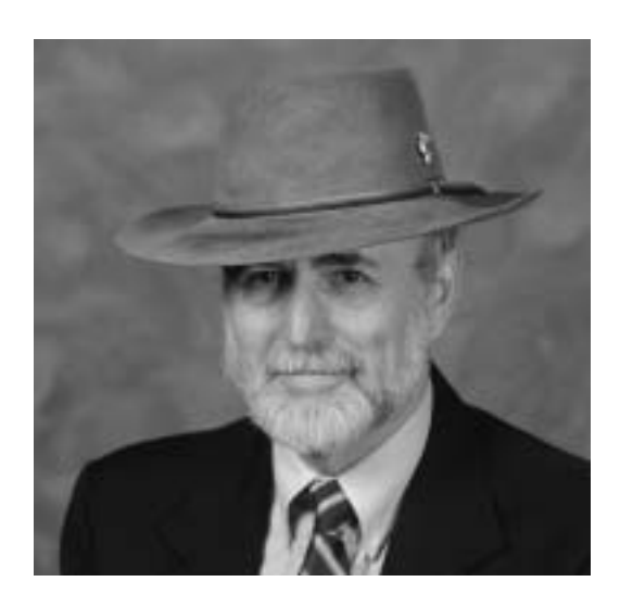
by David F. Rogers Copyright © 2001 David F. Rogers. All rights reserved. http://www.nar-associates.com

Several years ago I wrote an article called Is There a Step ? The basic premise of the discussion was that under certain conditions, particularly at higher altitudes, the power available and power required curves have two intersections (see Figure 1). Each intersection represents a speed for level flight at that power available and altitude. One of the speeds is on the so called back side of the power required curve and the other on the front side. The back side of the power required curve represents speeds slower than that for minimum power required, while the front side represents speeds higher than that for minimum power required.